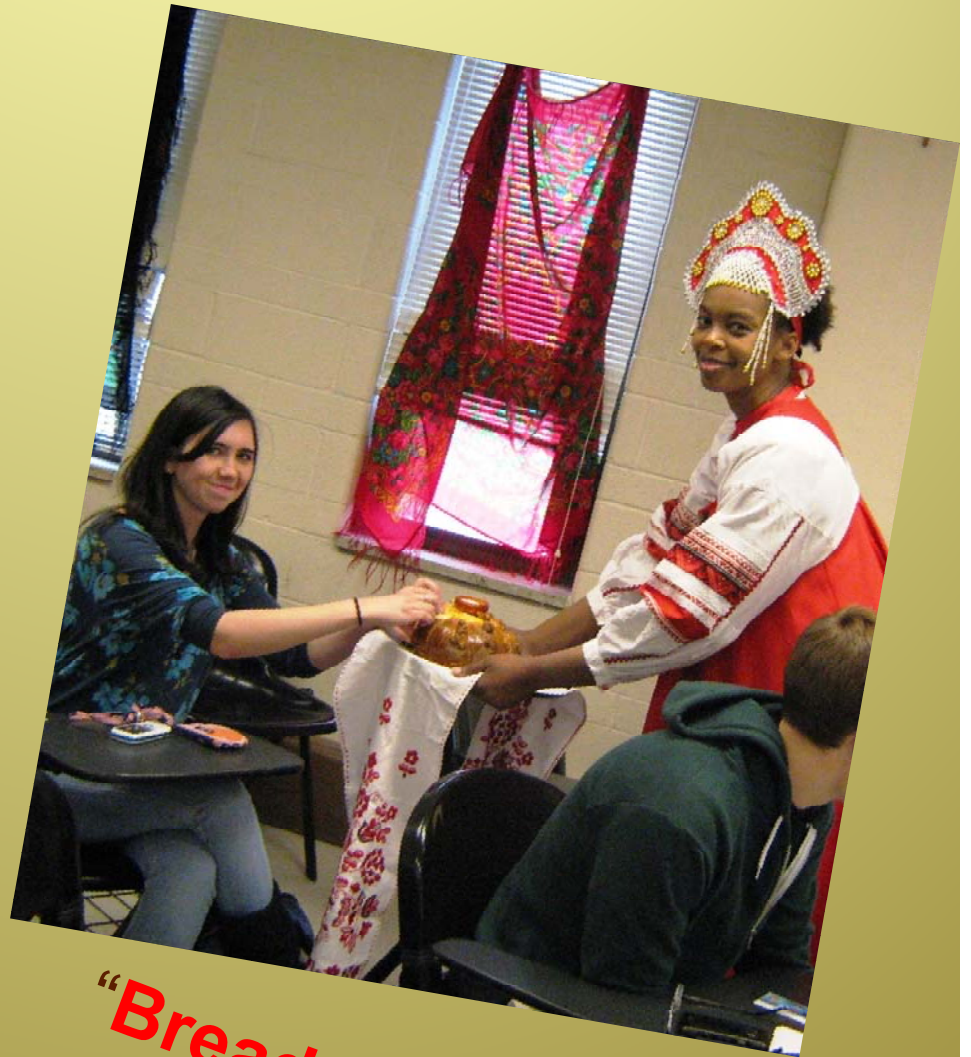
“Bread & Salt” Ceremony of welcoming guests