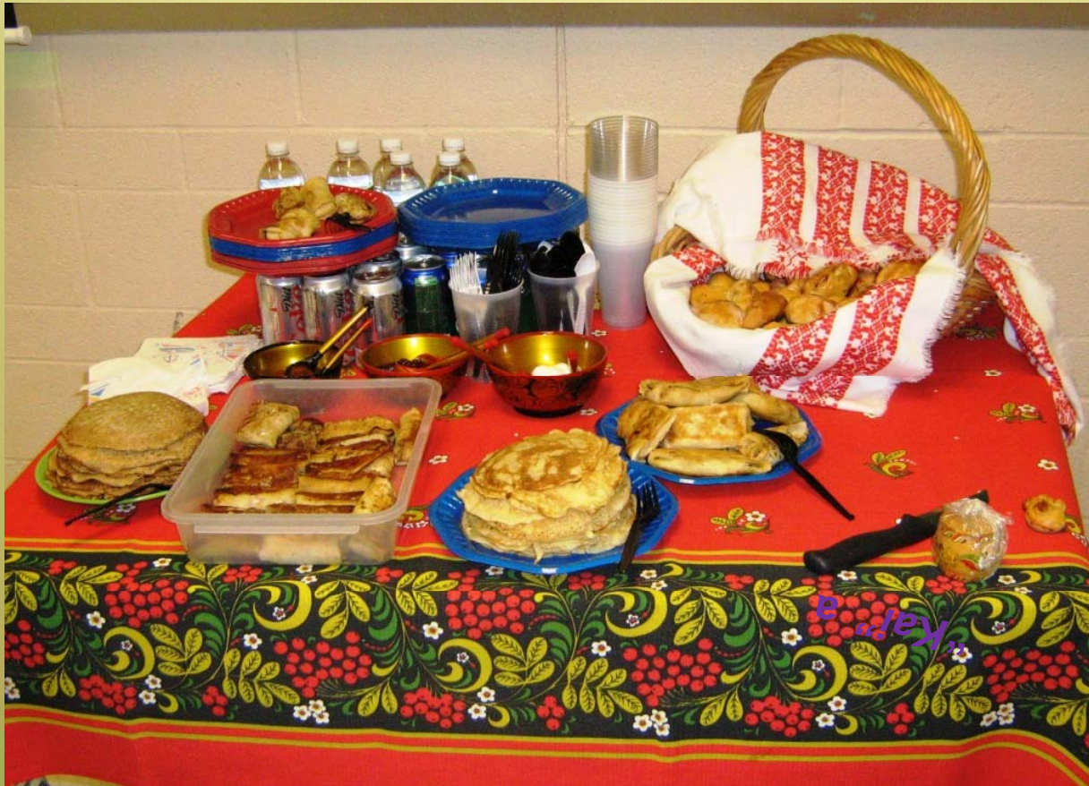
Table ready for Party!!!!

Bliny (pancakes) , pirozhki (little pies), sushki (small pretzels) with sour cream, jams, preserves