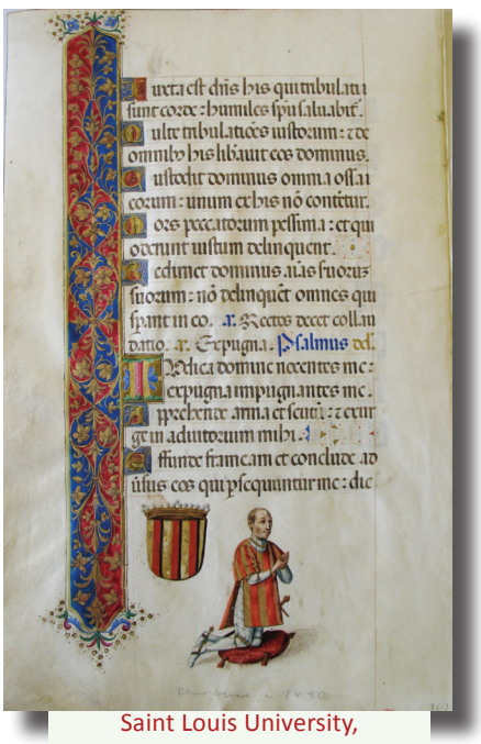
Saint Louis University, Pius XII Memorial Library, Special Collections, MS 55a verso

SPEAKING OF EYE-CATCHING, perhaps the manuscript community can help us out with two leaves from our Special Collections teaching collection. Their provenance is unsure, but they are annotated in pencil as being 15th-century Florence, with 17th-century additions (MS 55a verso: the kneeling knight, coat of arms, and overlaid border decoration); (MS 55b recto, the dancing girl and coat of arms).