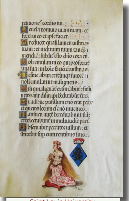
Saint Louis University, Pius XII Memorial Library, Special Collections, MS 55b recto

The leaves appear to be breviary fragments, and mostly contain Psalm verses: MS 55a runs from Ps 33:10 through 33:23, followed by two short passages and the beginning of Psalm 34:1-3 on the verso. MS 55b opens with Ps 36:4, and ends on the verso with Ps 36:27. The illuminated initials appear to be original to the 15th century, as well as the delicate floral motifs with filigree penwork and gold dots at upper and lower ends of the later bar border on MS 55a verso, which to my eyes look more like northern Italy. I am especially intrigued by the delicate line fillers, which are new to me for 15th-century Italian decoration. We have conjectured that the later additions could have been someone's attempt to increase the value of the otherwise simply decorated leaves, for resale. The figures are very beautifully executed. Can anyone shed any light on date and place of production, identity of later artist (forger?), or provide comparable examples of the line fillers and the illuminated initials? Any suggestions will be highly appreciated. Please send comments directly to me at lengles@slu.edu.