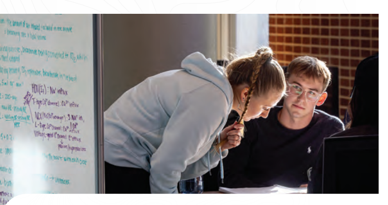
Students studying at SLU's Pius XII Memorial Library