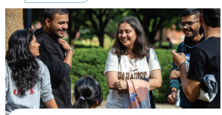
New international students chat at a welcome party during International Student Orientation.

STUDENTS PARTICIPATE IN SHORT-TERM INTERNATIONAL EXPERIENCES EVERY YEAR. (winter break, spring break and short-term summer trips)