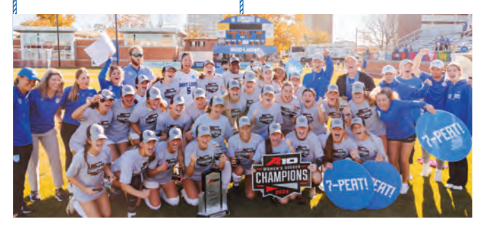
The women's soccer team celebrates capturing the A-10 Championship title for the seventh consecutive season.