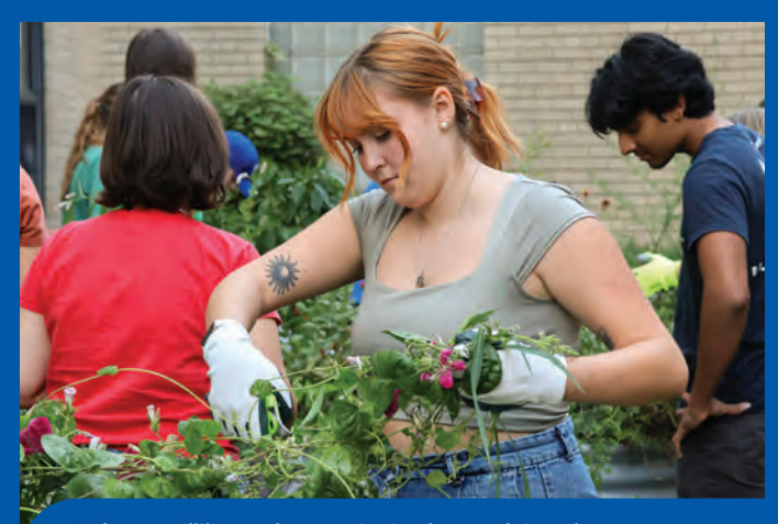
SLU's\ Green\ Billikens\ student\ organization\ cleans\ up\ their\ garden.

2,000+ K-12 STUDENTS tutored through SLU community engagement efforts