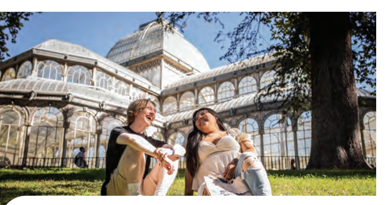
SLU-Madrid students in Parque del Buen Retiro, one of the largest parks in Madrid, Spain.