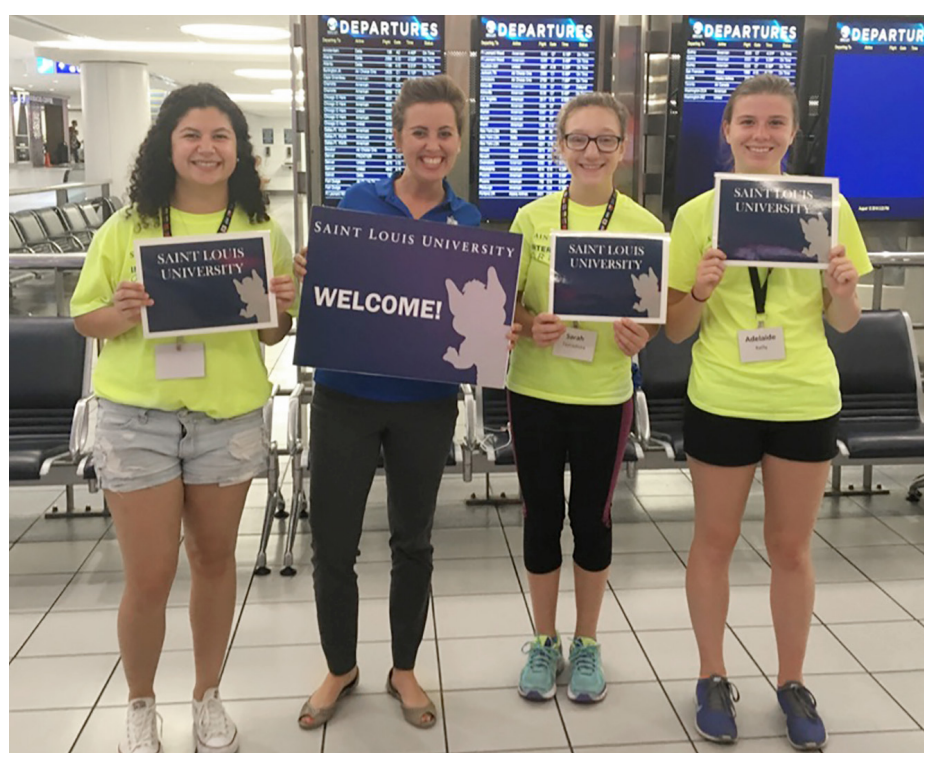
▲ When you arrive at the airport, look for SLU employees wearing blue polos and student ambassadors in yellow.