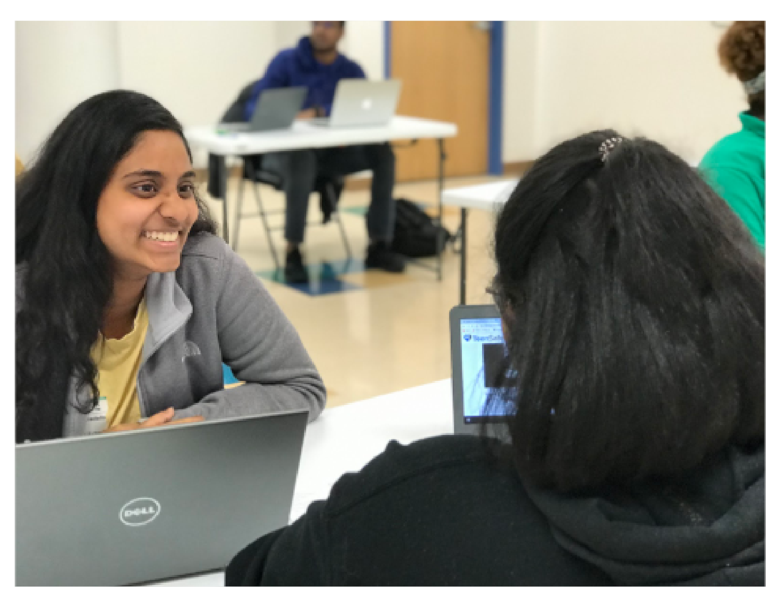
A SLU student works with a local high school student on college application prep as part of the OverMatch Mentoring project.

The 1818 Community Engagement Grant program received 36 applications in its second year. 18 were selected and provided with up to $1,800 each to implement a project that would positively impact the community. Despite the challenges of the COVID-19 pandemic*, most projects were implemented with no change in the impact on individuals in the community. In fact, this year saw an almost 50% increase in the number of SLU participants, underscoring the significant amount of collaboration between units on campus.