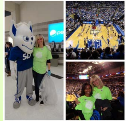
Green Game at Chaifetz Arena

Saint Louis University 212 N. Grand Blvd St. Louis, MO, 63103 http://www.slu.edu 600k sq. ft (office space) 7.5 million sq. ft. (GSF) 17,211 employees and students