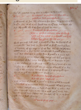
Berkeley Castle Muniments Select Book 89, fols. 1r, 9r