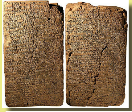
Fig. 12 "Debate between Summer and Winter" in Neo-Sumerian, probably from Larsa, Babylonia, ca. 1900–1700 BC. London and Oslo, Coll. Martin Schøyen MS 3283