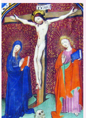
Bloomsbury's has positioned itself as a chief venue for text manuscripts and fragments, but Bolton's sale included a good Gold Scrolls Book of Hours, nearly complete (lot 111, £27,280) [I have added the 24% buyer's premium to the results reported online]. The "Gold Scrolls" school is usually identifiable by squiggly lines—i.e., "gold scrolls"—in the background panels of the miniatures [fig. 6]. With solid gold panels, however,

were auctioned in 1892 and 1894 [Peter Kidd's attribution: http://mssprovenance.blogspot.co.uk/2013/10/fritz-hasselmann-d1894.html]. A Hasselmann miniature for sale online also includes this mark [fig. 5].