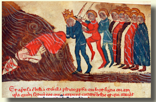
Fig. 4 Detail from the Libellus of Telesphorus of Cosenza, now Yale University, Beinecke Library

The Burrus manuscripts were so fine, unusual, and fresh that it's hard to drop any of them from an account of the sale. Exceptionally desirable was a complete thirteenth-century illuminated Pocket Bible with 78 historiated and 60 flourished initials (lot 3, £68,500). In a mid-fifteenth century Italian copy on paper, Tractatus de usuris decried the system of forced loans in early Renaissance Florence. Does it have relevance for American Social Security? De bello a Christianis contra barbaros gesto by Benedetto Accolti may well be the last manuscript of this rare work on the Crusades ever to become available (lot 12, £80,500). Given the exceptional rarity of the text, it may be the "lost" manuscript collated by an English ambassador to Venice in the seventeenth century [Hermann Hagen, "Eine neue Handschrift von Benedetto Accoltis Geschichte des Kreuzzuges," Vierteljahrsschrift fur Kultur und Literatur der Renaissance 1 (1886): 134–36]. Quite understandably, a pristine, handsome, and chunky (cont.)