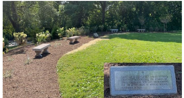
Cemetery plaque, plot 39A

"Saint Louis University and its students gratefully acknowledge the charity of those buried here, who gave their remains for the advancement of medical science." September 29, 1964