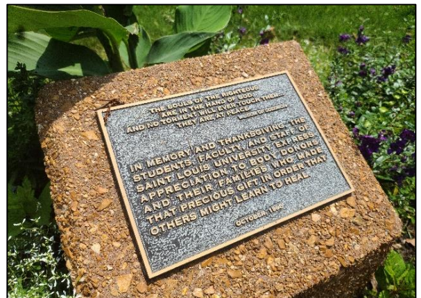
Caroline walkway plaque, SLU South Campus

"In memory and thanksgiving, the students, faculty, and the staff of Saint Louis University express appreciation to body donors and their families who made that precious gift in order that others might learn to heal." October, 1995