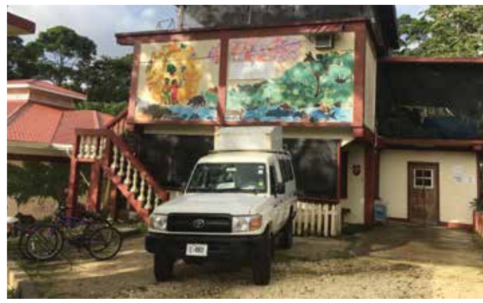
Top ● Hillside Clinic Bottom ● The road Hanson bikes to work each day

"My public health rotation at SLU encouraged me to get involved in the community and to advocate for my patients not just on the day I see them but beyond. I don't know where my path will lead me but I'll always be an advocate for my patients. That's my motivation."