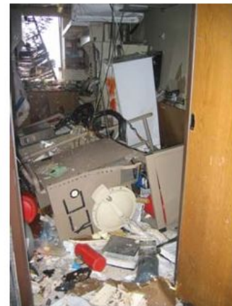
Figure 3 - Inside the Laboratory after Explosion

The catastrophic failure of the nitrogen cylinder was a direct result of the removal and subsequent plugging of the internal tank pressure relief devices. The cylinder was modified by inexperienced and unidentified person(s) resulting in the eventual failure of the cylinder. It could not be determined when the modifications took place.