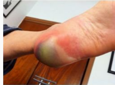
LN2 Burn Week 1