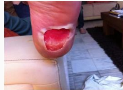
LN2 Week 2