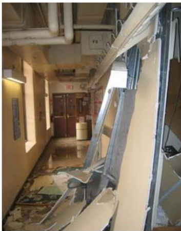
Figure 2 - Hallway Outside Laboratory Showing Explosion Damage

At approximately 3:00 a.m. on Thursday, January 12, 2006, an explosion occurred in a state university chemistry building laboratory, causing substantial building damage. The explosion resulted from a rupture in a liquid nitrogen (Dewar) cylinder. The cylinder was originally constructed and tested in December 1980.